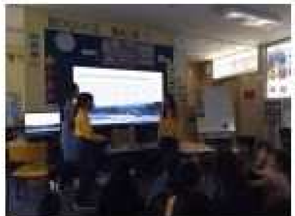
Students in 5R presenting a slideshow about how to prepare for a flood.