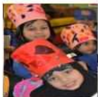
100 Days at School!