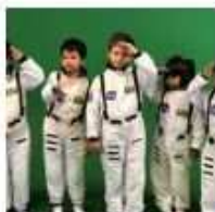
Visit to the Powerhouse!