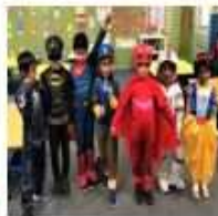
Book Week Parade!