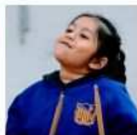
Fun with Learning!