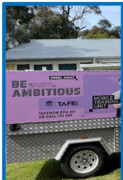
Chester Hill Public School